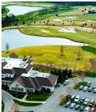
LIV GOLF PARKING