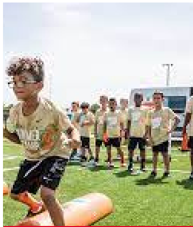
YOUTH SUMMER CAMP